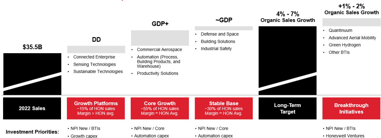
Exhibit 2 – Portfolio Growth Composition